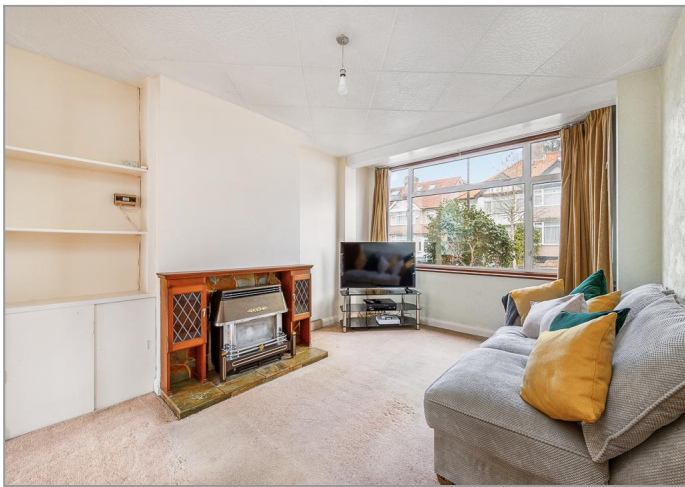
Front Reception Room