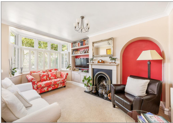
Front Reception Room