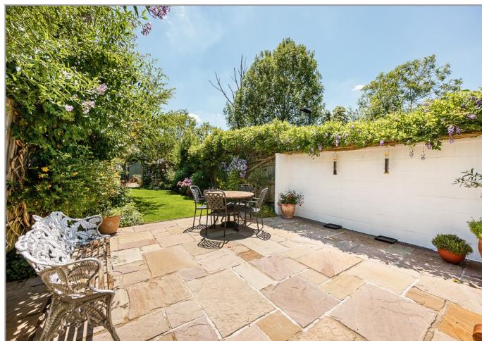
Wonderful 100" Southerly Facing Garden