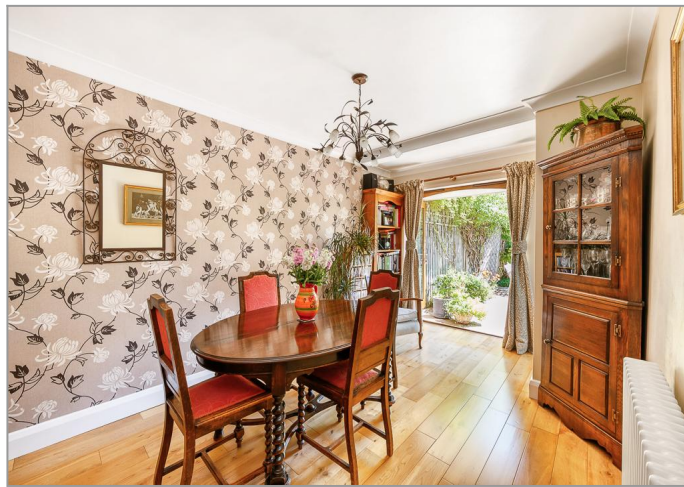
Superb Dining Room