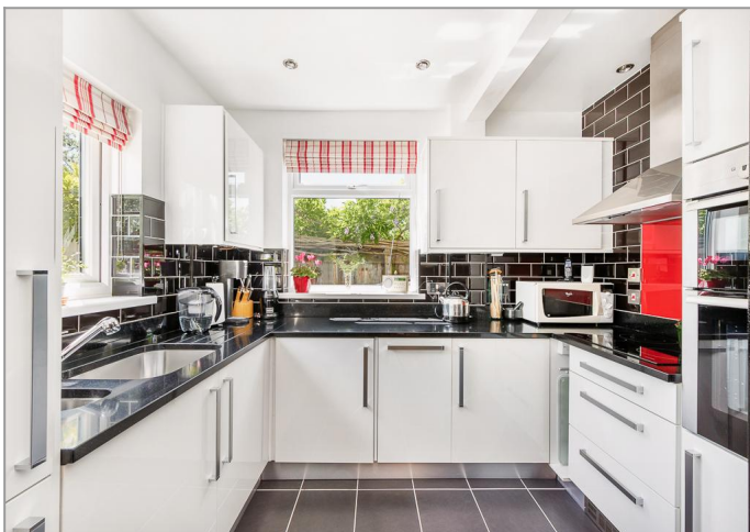
Stylish Integrated Kitchen Area