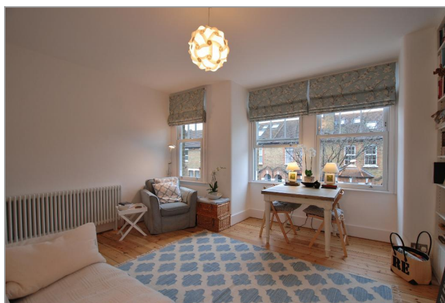
Living/Dining - Alternative View