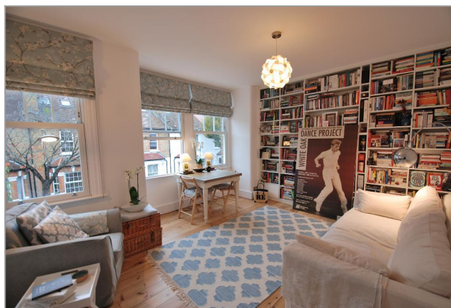
Generous Living/Dining Room