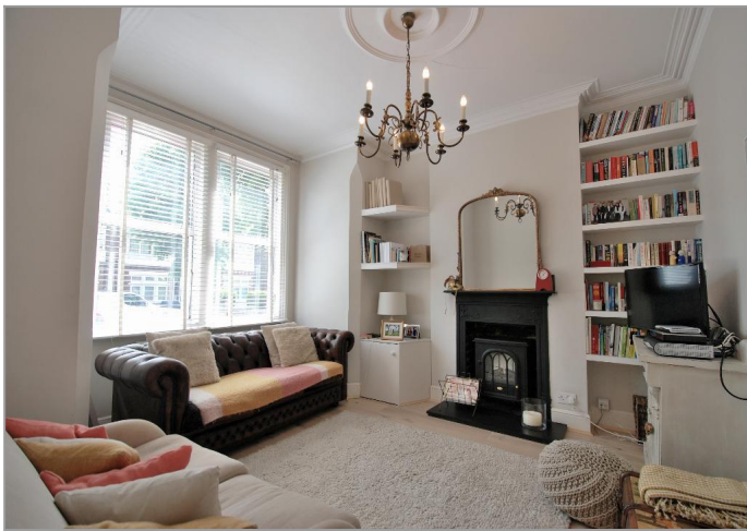
Generous Reception Room