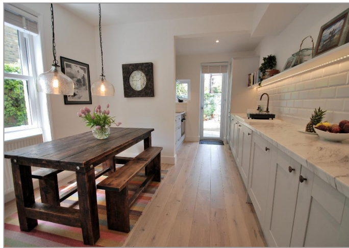
Open-Plan Kitchen/Dining Room