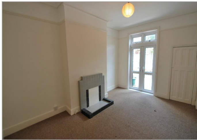
Rear Reception Room