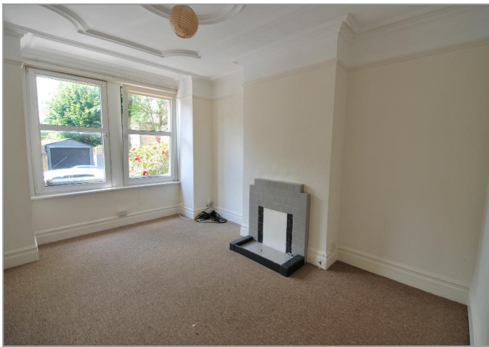
Front Reception Room